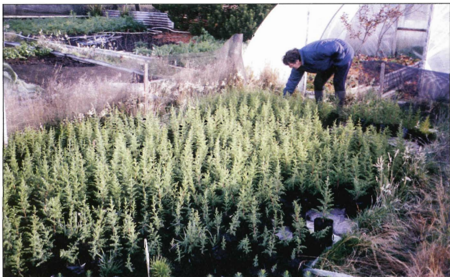
FIGURE 9. GOOD QUALITY MACROCARPA IN POLYPOTS, SHALLOW HARBOUR. ALTHOUGH LESS THAN 1 YEAR OLD, THESE ARE READY FOR PLANTING OUT.