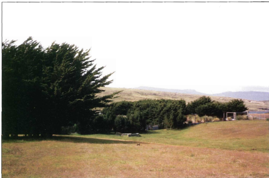
FIGURE 3. “MACROCARPA” (FOREGROUND, LEFT) AND SOUTH COASTAL LODGEPOLE PINE AT FITZROY.

Other coniferous species which show some promise for shallow peat sites are Pinus radiata (Monterey pine), Pinus nigra var. nigra (Austrian pine), Pinus muricata (Bishop pine) and the hybrid cypress X Cupressocyparis leylandii (Leyland cypress), which has Monterey cypress as one parent.