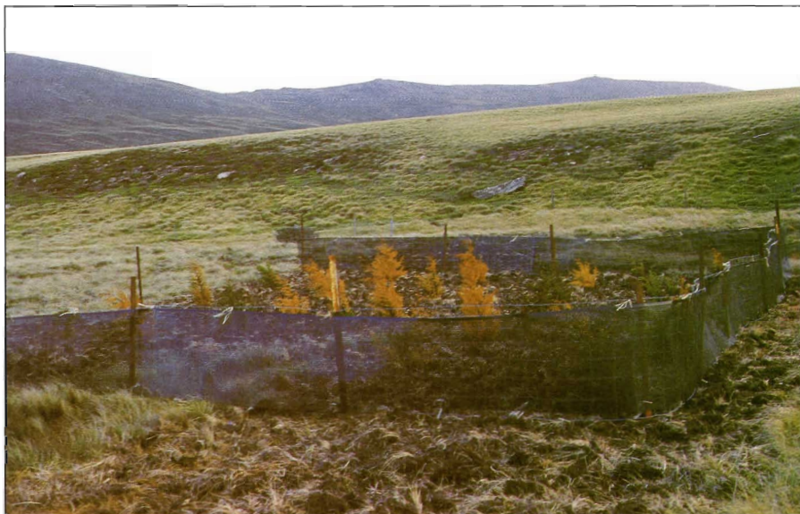
FIGURE 2. A FAILED PLOT OF “MACROCARPA”. THE SITE IS PROBABLY TOO WET, IN A FROST HOLLOW AND THE TREES MAY HAVE BEEN TOO LARGE WHEN PLANTED OUT.