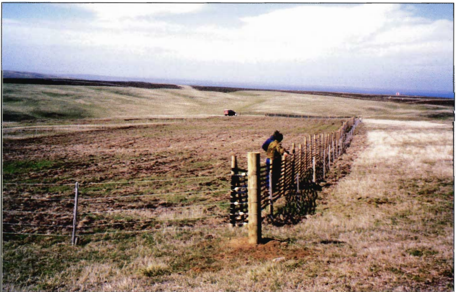
FIGURE 12. FENCING FOR STOCK AND SHELTER, SHALLOW HARBOUR.

As mentioned earlier, the addition of plastic shelter netting or screening to the windward (and possibly also to the leeward) fence line can provide valuable shelter to the young trees during the establishment stage. Although an expensive option, the extra shelter will improve survival and early growth of the young trees and is likely to bring forward by 2 - 3 years the stage at which the belt begins to provide worthwhile shelter. Old pallets can also be used successfully to form a shelter fence. Individual short (30 cm) plastic tree shelters, held in place using canes, can be used to minimise wind desiccation during the first winter, but must be removed in early spring before new shoot growth begins. These shelters can then be re-used several times for new plantings.