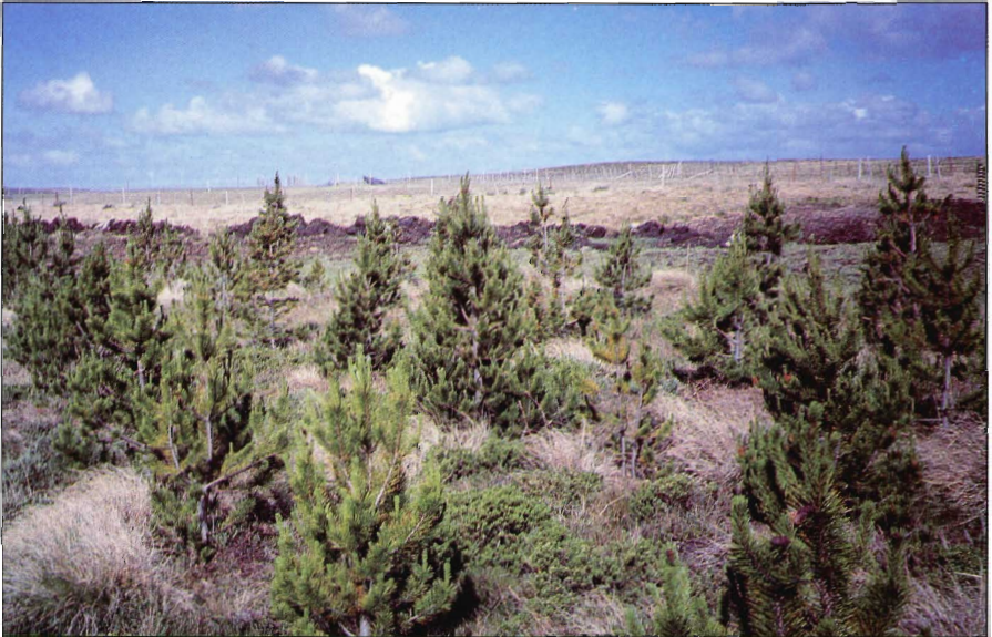
FIGURE 1. 6 YEAR OLD, PIT PLANTED COASTAL LODGEPOLE PINE GROWING WELL IN UK FALKLAND ISLANDS TRUST TRIAL, FITZROY FARM.