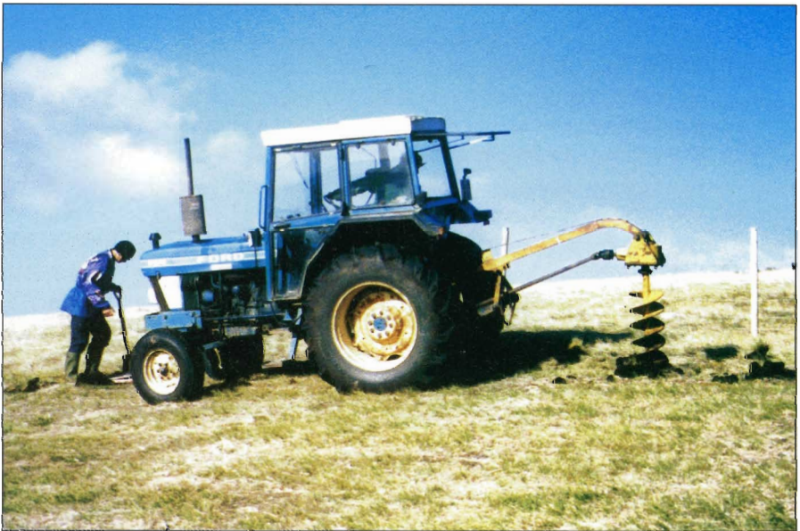
FIGURE 5. TRACTOR MOUNTED POST-HOLE BORER MAKING PLANTING PITS, PORT HOWARD.

Spaced furrow ploughing with a robust single-furrow unit along the length of the belt can be used to create additional early shelter for the young trees. The plough must be capable of turning out and inverting a 15 - 20 cm thick turf ridge on the leeward (usually east) side of the furrow (with planting later to be done on the east side of the ridge). Furrow spacing should correspond to the tractor rear wheel spacing. However, note that if a site is ploughed in this way, it may well not be possible to use a tractor-mounted post hole borer to make planting pits (see below). In view of this, spaced ploughing is probably best used only on very windy locations where the early shelter provided by the ridges may make the difference between establishment success and failure.