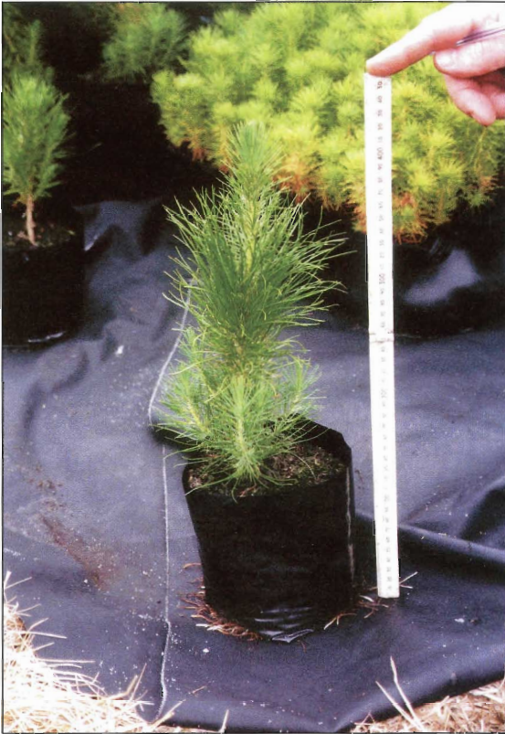
FIGURE 10. GOOD QUALITY CONTAINERISED 1 YEAR OLD TRANSPLANT, SHALLOW HARBOUR. PLANTS BIGGER THAN THIS WILL SOON BECOME POT BOUND AND LESS SUITABLE FOR PLANTING OUT.