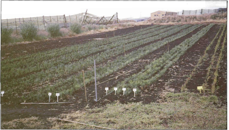
FIGURE 6. BARE ROOTED TRANSPLANTS OF LODGEPOLE PINE FROM UK 'LINED OUT' AT STANLEY GROWERS LTD, STANLEY.