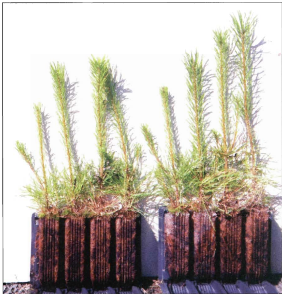
FIGURE 8. ROOTRAINER GROWN STOCK ARE HIGHLY RECOMMENDED.