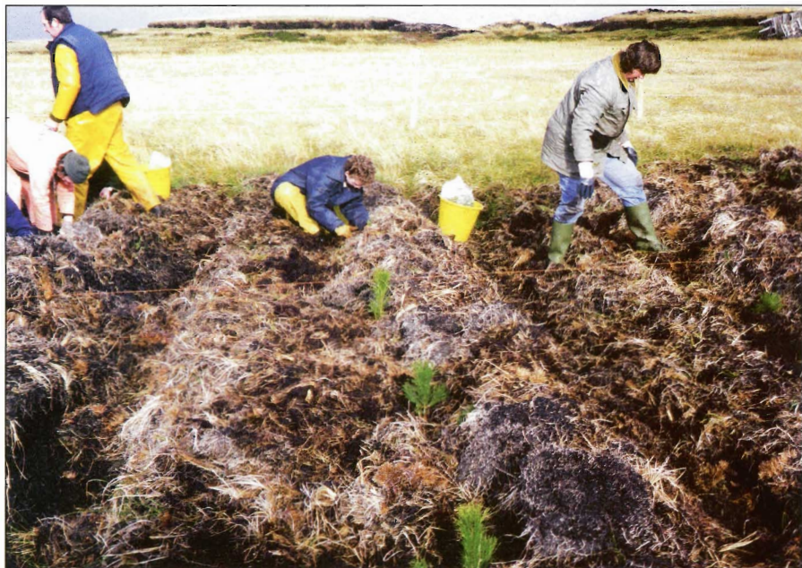
FIGURE 11. PLANTING ON THE LEEWARD SIDE OF PLOUGHED FURROWS, ESTANCIA.

IF DEATHS DURING THE FIRST 2-3 YEARS RESULT IN SIZEABLE GAPS OR AMOUNT TO MORE THAN 5% OF THE TOTAL PLANTED, THE DEAD TREES SHOULD BE REPLACED BY PLANTING NEW TREES (IDEALLY OF THE SAME SPECIES) AT A SIMILAR TIME OF YEAR.