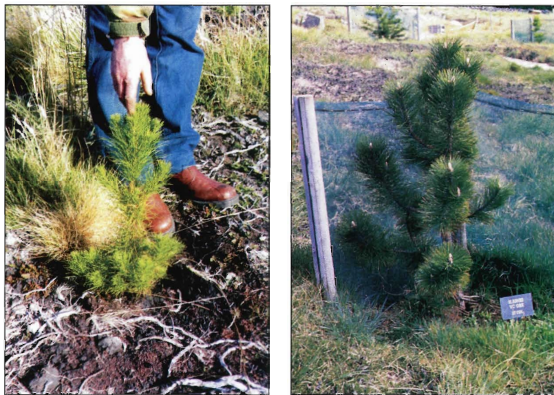
FIGURE 4. MONTEREY PINE (LEFT) AND AUSTRIAN PINE (RIGHT) ARE WORTH TRYING IN THE FALKLAND ISLANDS.

be planted, even on moist soils. The mild Falkland winters unfortunately favour a build-up of aphid populations.