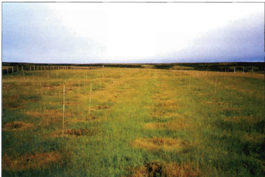
FIGURE 13. SPOT SPRAYING WITH “ROUNDUP” BEFORE PLANTING, SHALLOW HARBOUR.

It is also necessary to protect the site indefinitely from damage by fire. If the risk is thought to be high, the most practical approach is to maintain a 5 metre wide firebreak round the belt by regular rotovation or flail mowing and grazing to keep down the vegetation.